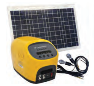
Andes Solar Home System